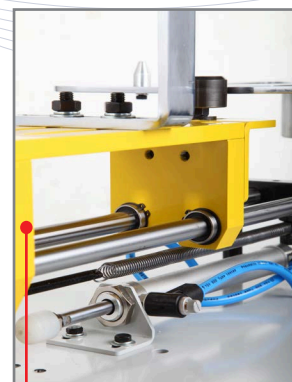
Auto adjustable tray