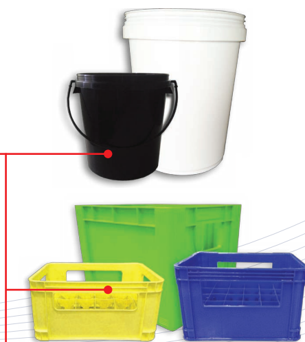
Samples cured by Flamer 49