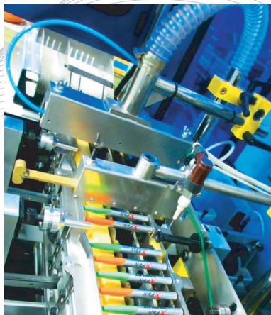
▶ Antistatic & Flame Device