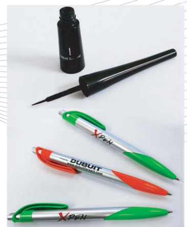
▶ Small objects such as Mascara,