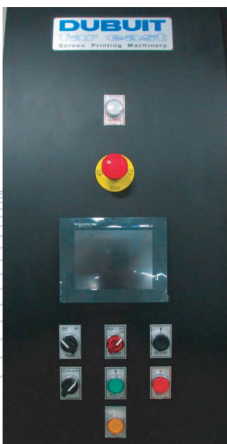
▶ PLC CONTROL