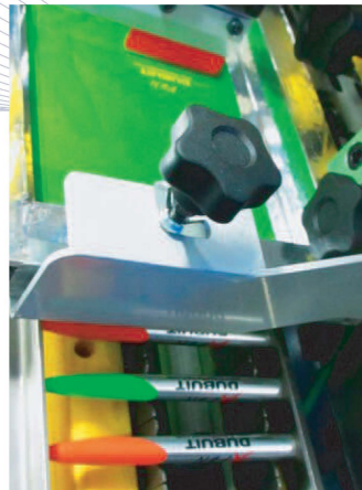
▶ Simple & Double Production